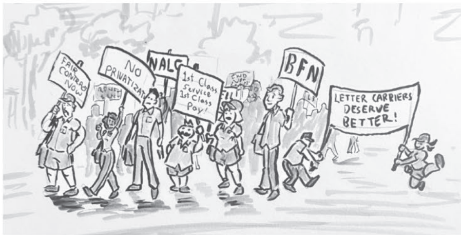
Illustration by Latham Luepke, Lowry Station

Fight for a strong contract! NO to privatization!