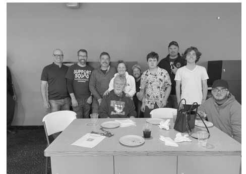
LUCKY LOWRY CARRIERS