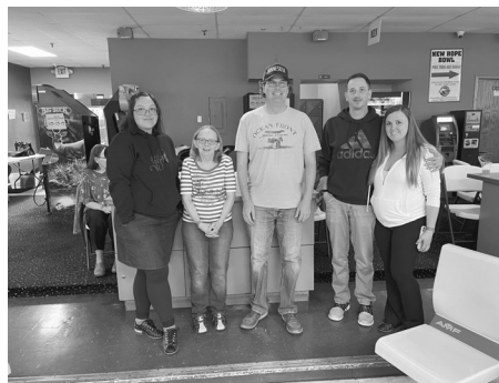
TEAM COL. HEIGHTS/ RICHFIELD