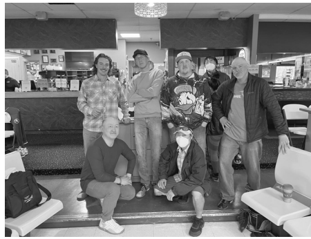
TEAM BROOKLYN CENTER