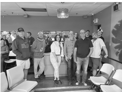
TEAM LOST LAKE