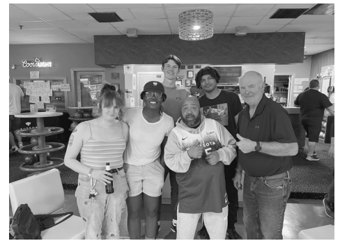
TEAM ST LOUIS PARK