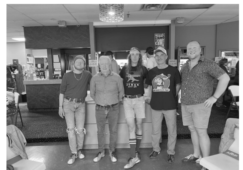
TEAM LAKE STREET