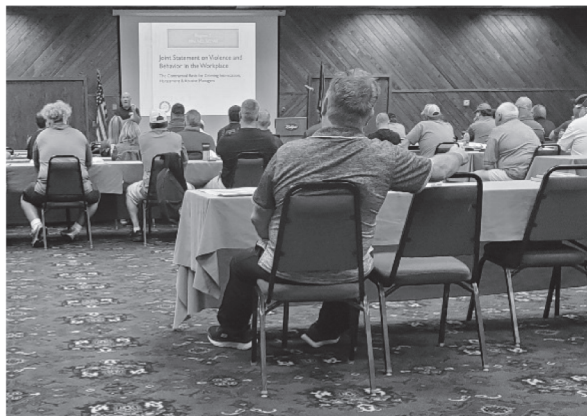
Members attending the daily meetings