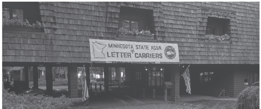
MSALC 2023 Convention was held at Ruttger's Bay Lake Resort