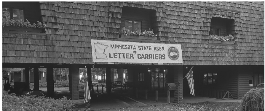
MSALC 2023 Convention was held at Ruttger's Bay Lake Resort