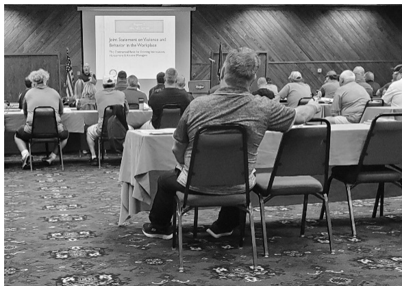
Members attending the daily meetings