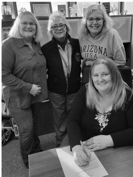
Final signature to purchase our new home.

March has been a very busy month with the purchase of the new Branch Office, and the sale of our old property at 2408 Central Ave NE Minneapolis, all in the first week of the month. After some minor remodeling the Branch Office will be moving from the temporary location to the new