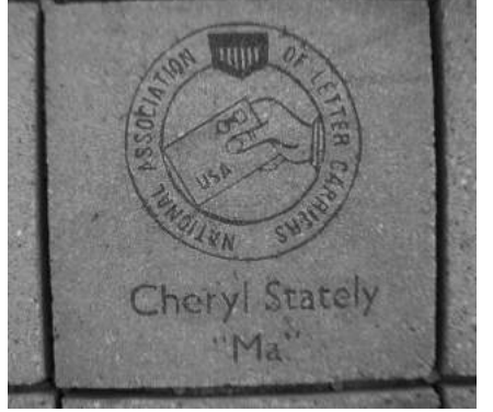
New engraved paver at the AFL-CIO pavillion.