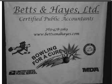
MDA Lane Sponsor Betts & Hayes, Ltd. (Branch 9's Accountants)