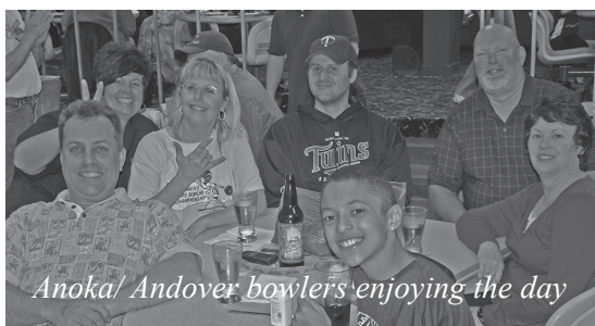
Anoka/ Andover bowlers enjoying the day

drawings, and silent auction raised more than $7000 for MDA!