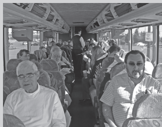
Turtle Lake Casino Bus