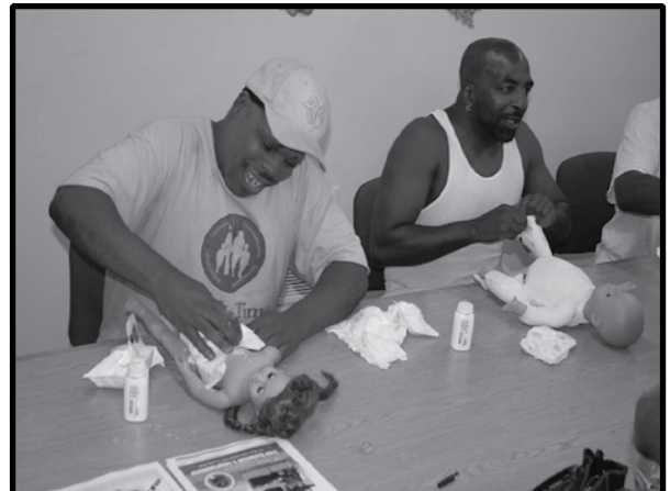
What's a shower without games. These guys raced to see who could change a dirty diaper the fastest.