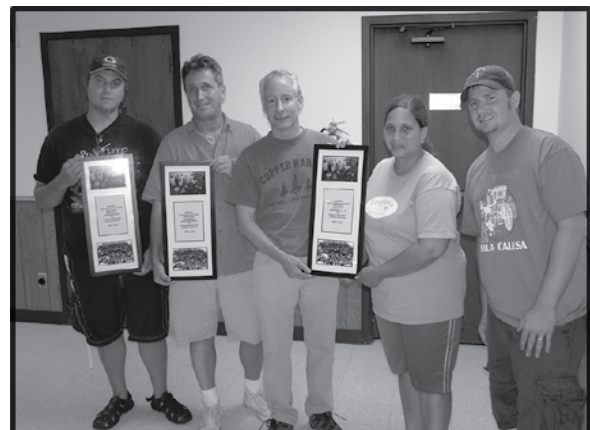
Thank You Certificates were presented to the Stewards from Coon Rapids, Lake Street, and Richfield.