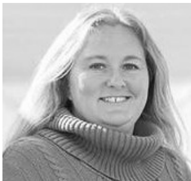
Leadership In Action

I began my career with the USPS in 2003 as a PTF carrier assigned to the Main Office downtown Minneapolis. During my orientation I knew it was important to join the union. I come from a union home, my dad is a retired cement finisher, and I recall vividly the strike sign that hung on the wall in the garage, and how proud he was to be part of a union. I guess you could say it is in my blood. The first day on the job my supervisor brought me into the office and told me that they didn't want me, but they were stuck with me. I was so nervous after that moment, and I couldn't believe this is how someone would be treated. As a single mom with a three year old at that time I just sucked it up, and began to learn how to deliver the mail. Then I got to know my co-workers, and they supported me, and guided me along the way; with their assistance I passed my probation. I learned from my co-workers that words in a contract are not enough. Knowledge, action and the support of a group, a UNION; that is the key!