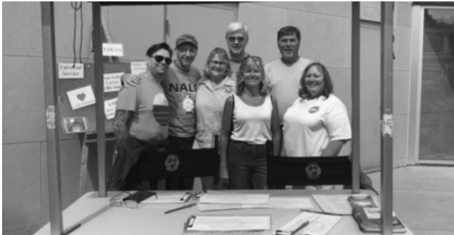
Look at all the vistors we had at our Kiosk.