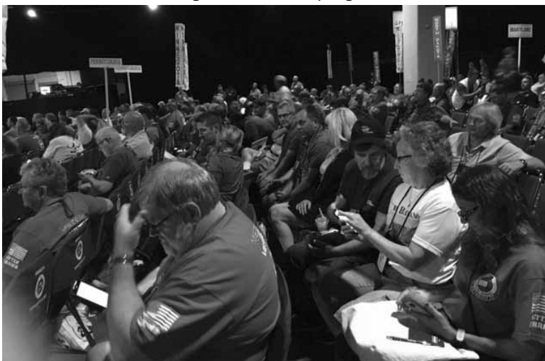
Branch 9 Delegation on the floor of the convention