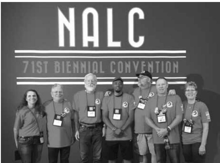
Branch 9 NALC Veterans Group wearing the red T-shirts reading "Veterans Helping Veterans."