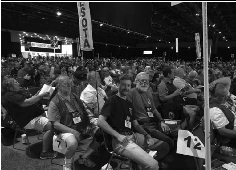
Branch 9 delegation on the floor of the convention