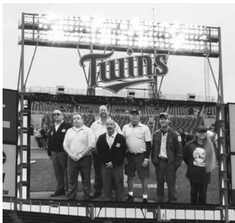
Carriers at the Twins game promoting Stamp Out Hunger

General Membership Meeting 7:00PM Crystal VFW, Crystal, MN