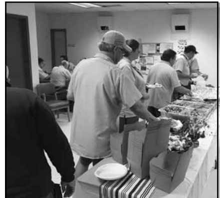
West Edina carriers enjoys a celebratory breakfast for a big sale with Customer Connect. Job well done West Edina!