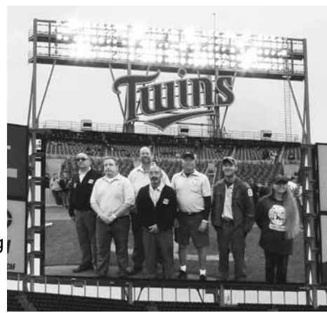
Carriers at the Twins game promoting Stamp Out Hunger

July 23 General Membership Meeting 7:00PM Crystal VFW, Crystal, MN