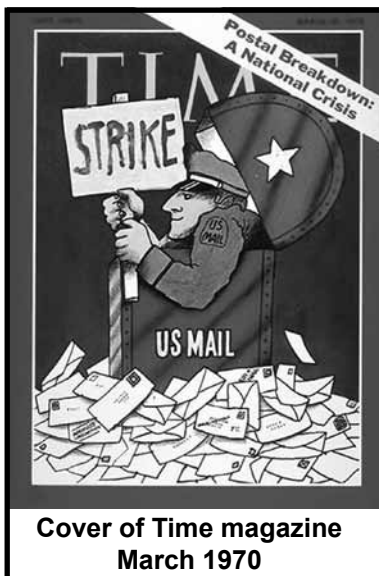
Cover of Time magazine March 1970