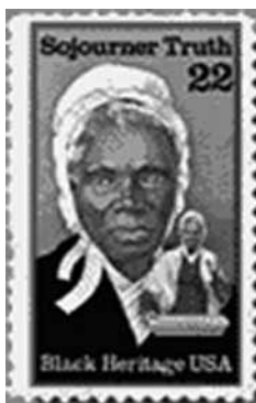
Soujourner Truth Born Isabella Baumfree, she was the first black woman to speak publicly against slavery

More information about historical women on stamps at: www.infoplease.com