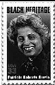
Patricia Roberts Harris First African American named to a Presidential Cabinet