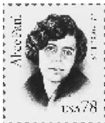
Alice Paul Founder of National Womens Party and author of Equal Rights Ammendment