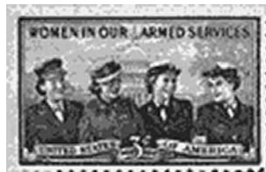
1952 stamp belatedly acknowledged women's military role during WWII.